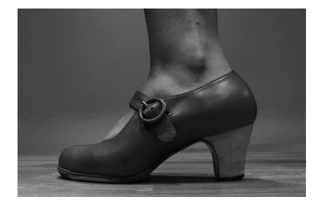
FIGURE 1. Flamenco dancing shoe with a rigid-soled leather with metal tacks on the heel and toe.

The participants completed a form providing their demographic information, injury history, and anthropometric data related to the practice of flamenco dancing. Forefoot pain during the execution of their professional activity was also recorded. Dancers were asked whether they suffered from pain or not. No method of rating the level of pain was used because examination of the flamenco dancers was made, in many cases, in periods when they were not dancing daily (during rest periods, for example, so that they could dedicate time to the authors of this study). The authors thought that the use of some type of pain scale would not have reflected rigorously the amount of pain perceived, so simply a yes/no variable was